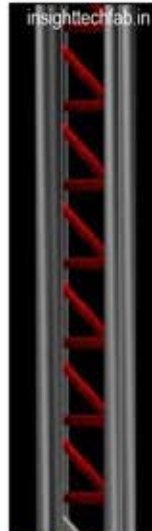
OPEN WEB STEEL JOIST